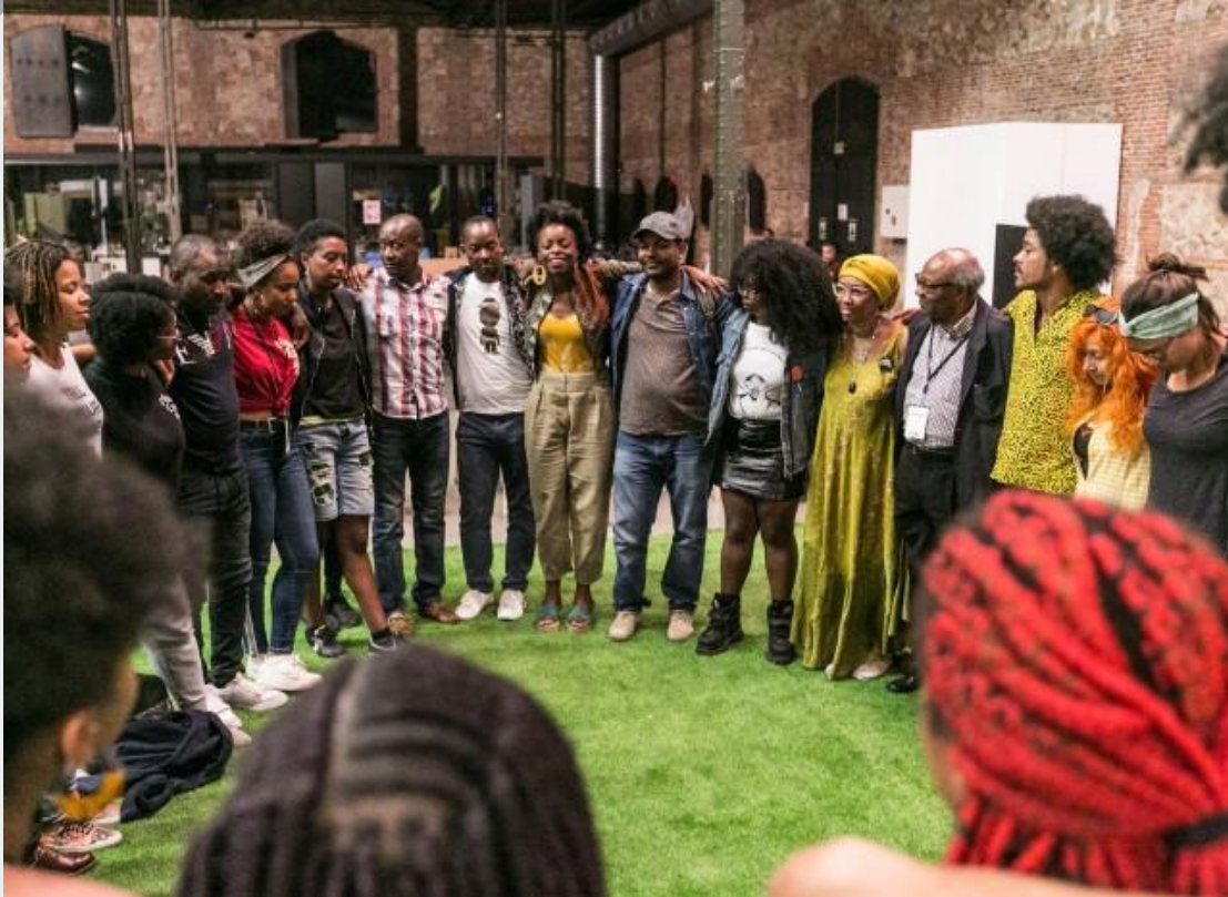
Conciencia Afro Madrid