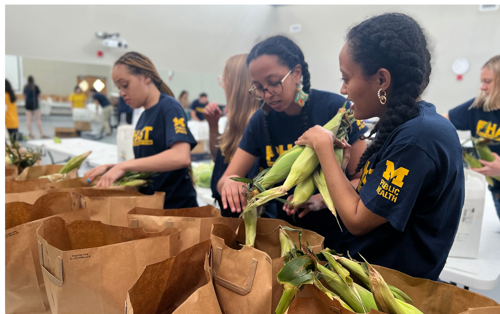
Photo: Students in Mississippi assisting with packing boxes for the Food Is Medicine program.